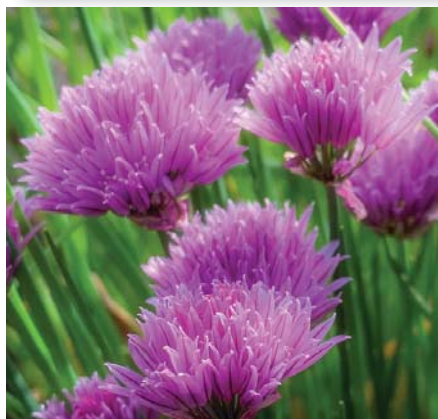
04 - Back yard chive explosions.jpg