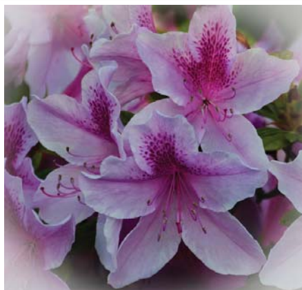
03 - Azalea George L Taber.jpg