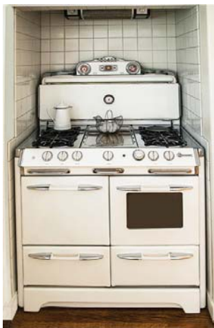
01 - 1950 O'keeff&Merritt.jpg